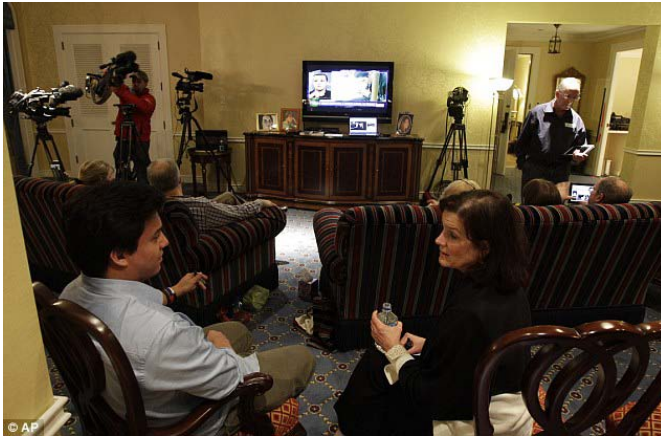
Hopes: Supporters of Amanda Knox hold an overnight vigil on the eve of the appeal verdict