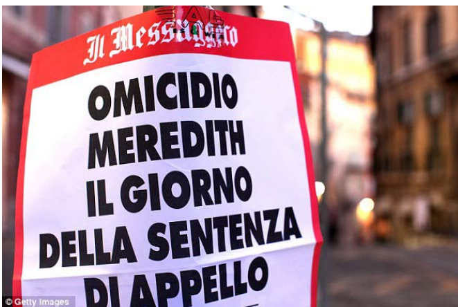
High profile: A poster announces the day of the appeal verdict