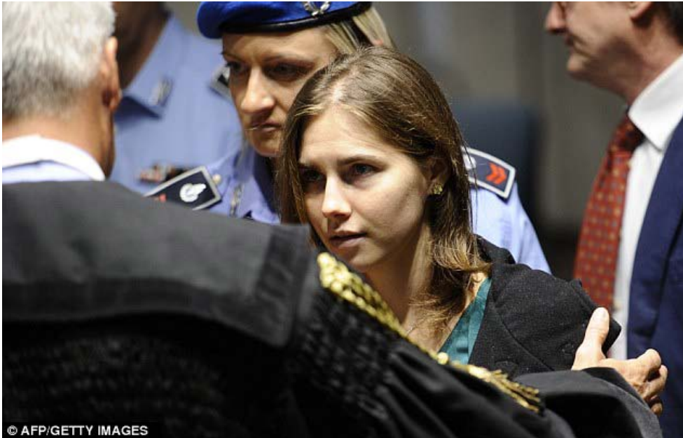
Guilty: Amanda Knox, pictured arriving at a hearing in Perugia this morning, had her appeal against conviction for the murder of British student Meredith Kercher rejected this evening