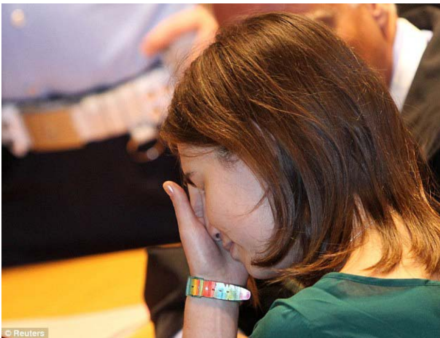
Tears: Amanda Knox weeps in court earlier today. She will now return to prison to continue her 26-year sentence for the murder