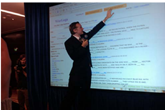
Julian Assange at the WikiLeaks Press Conference, London

The news of how Iraqi citizens were tortured with the complicity and knowledge of the Americans and British is now all over the media in print and video worldwide. The torture carried out in Iraq completely undermines any justification for invasion. It is extremely ironic that the strength of Al Qaeda has been precisely created as a direct result of the invasion.