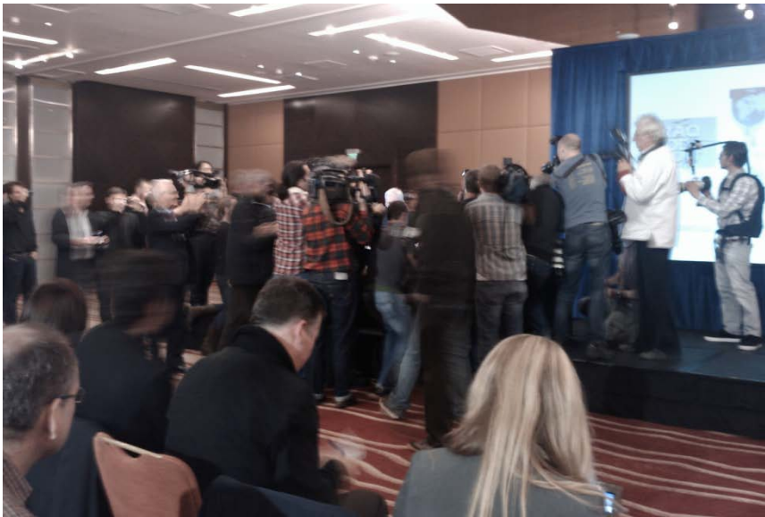
WikiLeaks Press Conference, London, Saturday 23 October 2010